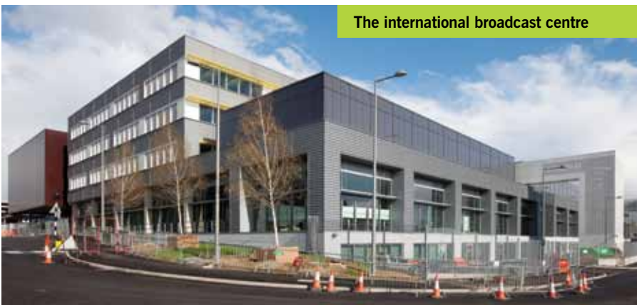
The international broadcast centre

The Games has created a real legacy for British food – providing the perfect opportunity to demonstrate the skills, craftsmanship and innovation that exists within our foodservice industry to the rest of the world. It has been a great platform to showcase BaxterStorey’s commitment to supporting local, artisan food suppliers by implementing a local supply chain throughout our operations – in short, buying British.