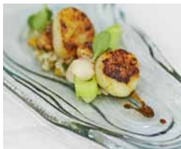
The 2011/2012 Winners, The Manchester College

Encouraging young people into our industry by giving them real life experiences