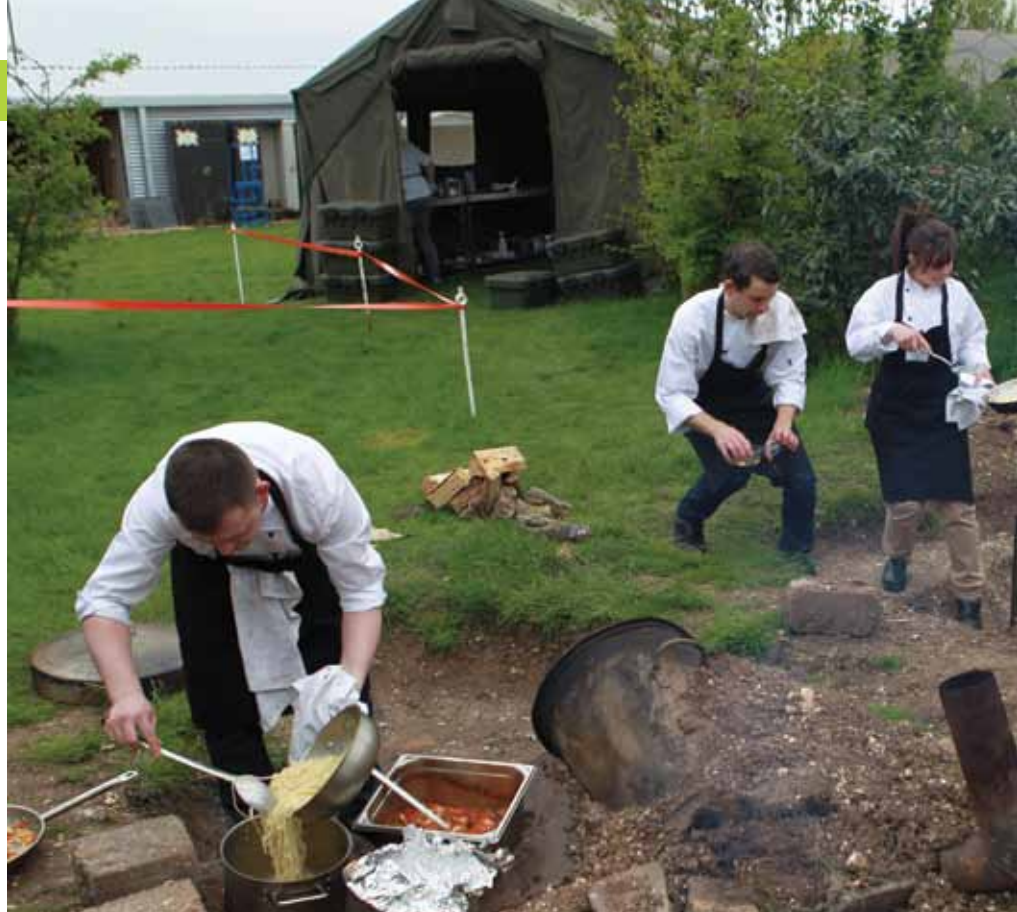
Be the Best: Finalists in the Nestle Toque D'Or were tasked with producing a three course meal for eight covers using only improvised cooking equipment and operational ration packs.

The company's commitments include a partnership with the education service provider Babcock to develop its management apprenticeship scheme, which will employ