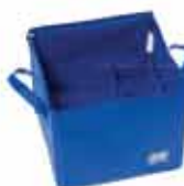
Giftbox (with partitions)